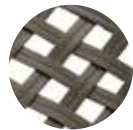
122 vulcano matting