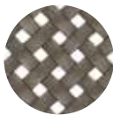
092 taupe light